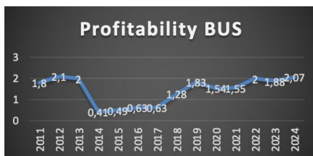
Figure 1. Profitability of Islamic Commercial Banks

external factors cause profitability fluctuations. 5 The internal banking factor that is directly related to profitability is the bank's performance, which can be observed through its level of soundness. 6 Meanwhile, the external factors related to banking are the quality of the business environment, regulations, and the current state of economic growth. 7